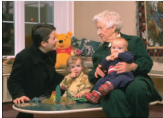
Three generations of the Hauser family enjoy the specially designed Children's Play Area at Terrace on the Square Retirement Residence, Waterloo.

The Terraces by Hallman submission (shown below) has won the 1999 ORCA Consumer Directory Cover Photo Contest.